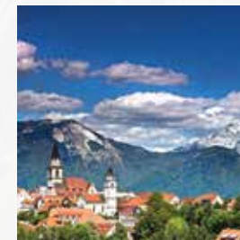
6. Views of the surroundings