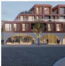
3. Mixing of public and private spaces