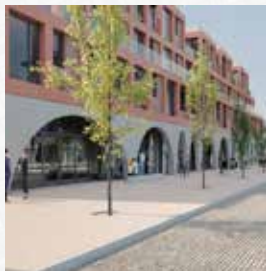
1. Urban passage