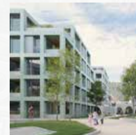
5. Green courtyards