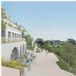
2. Viewing promenade