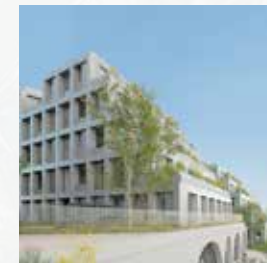
4. Green terraces